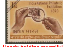
Hands holding magnifying glass on stamp

Asiana-77(2 stamps),India-80(10 stamps in 3 issues),Inpex-82(2 stamps),Inpex-86(2 stamps), India-89(14 stamps in 5 issues), Inpex-93 (2 stamps in 2 issues), Indepex-97(17 stamps in 5 issues and 1 souvenir sheet),Millepex-2000 (2 stamps), Indepex Asiana-2000(14 stamps in 3 issues), Inpex-Empirepex-2001(4 stamps).