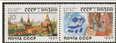
Stamp issued by USSR

India has also made Joint Issues with South Africa, Japan, France, Republic of Korea, Iran, Cyprus, Mongolia and China.