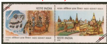
Stamp issued by India

First India Joint Issue Stamp. To express and exhibit the friendliness between two countries, stamps are issued as a joint issue. The stamp may contain same design or different design with the same theme. There may be slight changes in text language, currency, colour variation, size of stamp etc. The first joint issue was done with USSR (Union of Soviet Socialist Republics) on 16 th August 1990.