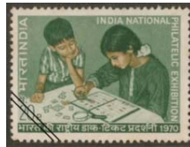
Children with stamp album

was issued on 23 rd December 1970 to commemorate India National Philatelic Exhibition 1970 in the denominations 20p and 1Re. India has issued stamps for the following Philatelic Exhibitions. Indepex-73.(4 stamps in 2 issues),Inpex-75(2 stamps),Inpex-77(2 stamps),