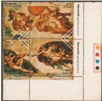
Birth Anniversary of Michelangelo Buonarroti-28-06-75