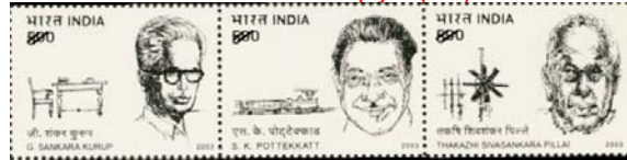
Jnanpith Award Winners-09-10-2003