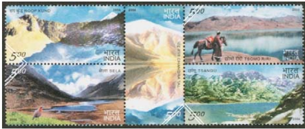
First Block – 5 stamps (SB-5) --- Himalayan Lakes-06-11-2006