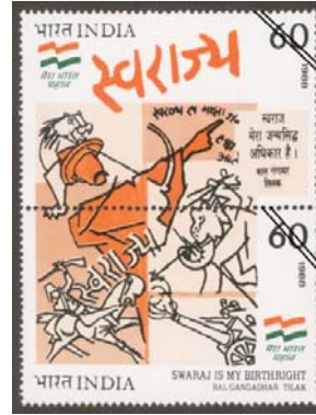
Freedom forty – Swaraj – 16-08-1988