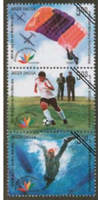
4 th CISM Military World Games, Hyderabad 14-10-2007

Se-tenant stamps possible in miniature sheets and mixed block sheets have not been taken into account. (so far 4 mixed block sheets have been issued)