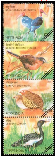
Endangered Birds of India-05-10-2006