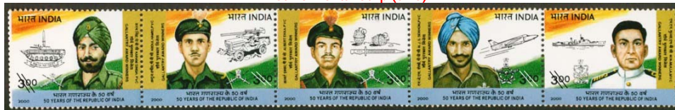
50 th Anniversary of Republic (2 nd issue), Gallantry Award Winners-28-01-2000

For Private circulation among Adhiparasakthi Educational Institutions at Melmaruvathur & G.B.Nagar only