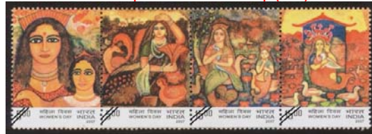
International Women's Day-08-03-2007