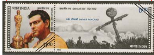
Film Director and Writer Sathyajit Ray-11.01.1994