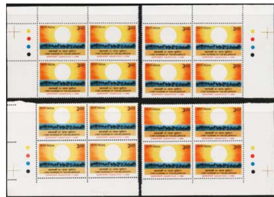
Stamp issued for the millennium sunrise on 01-01-2001, shown with all positions of Traffic lights

can be of various shapes like 8 or 6 or 5 pointed star or a perfect circle (dot). The size vary from small to large which depends mainly on the interest of the designer and the plate maker. The position of the dots (traffic lights) in a stamp sheet can be represented as TL1-left hand top corner, TL2-right hand top corner, TL3-left hand bottom corner and TL4-right hand bottom corner. Normally the order of colour dots will be