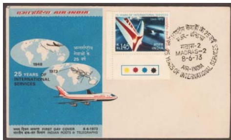
First Day Cancellation on Stamp with Traffic Lights