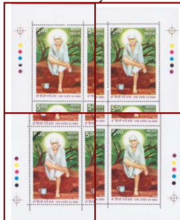
Shri Shirdi Sai Baba issued in 2008

can be of various shapes like 8 or 6 or 5 pointed star or a perfect circle (dot). The size vary from small to large which depends mainly on the interest of the designer and the plate maker. The position of the dots (traffic lights) in a stamp sheet can be represented as TL1-left hand top corner, TL2-right hand top corner, TL3-left hand bottom corner and TL4-right hand bottom corner. Normally the order of colour dots will be