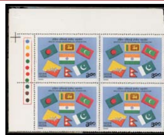
First SAARC summit, Daka. 08-12-85

the same on all four corner positions. See the millennium sun rise issue, all the TL's are in the same order. For the first time it was not in the issue on Shirdi Sai Baba stamp. TL1 and TL2 are same, but different from TL3 and TL4 which are alike. First stamp to have the letters CMYK instead of dots was the issue on President's body guard, 16 November 1998