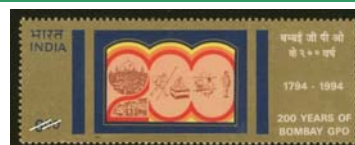
First stamp printed by Calcutta Security Printers (CSP), Kanpur.

First Stamp Printed by Calcutta Security Printers (CSP), Kanpur was issued on 28 th December 1994 in the denomination of 600 to commemorate the celebrations of 200 years of Bombay G.P.O.