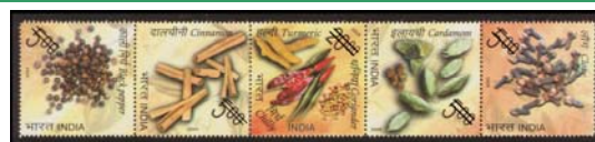
21 to 25 - Spices of India-Diamond Shape - Strip of Five