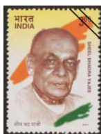
First stamp printed by Eagle Press Pvt. Ltd. (EPPL), Calcutta.

So far all stamps issued by India (except Gandhi stamps issued in 1948 – see News Letter-10) were printed by India Security Press (ISP), Nashik. Due to excess work at ISP, Madras Security Printers (MSP), pioneer in printing bank cheque books, travel cheques and security documents, was permitted to print the stamp on Endangered Water Birds of India, which was issued on 23 rd November 1994. It was a se-tenant block of four stamps. These stamps were withdrawn after a few days when it was found that the stamps were printed in water soluble ink. These were also the First Stamps to be Printed in Water Soluble Ink.