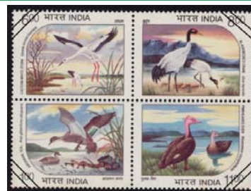
First stamps printed by Madras Security Printers (MSP), Chennai.

First Stamp Printed by Eagle Press Private Limited (EPPL), Calcutta was issued on 28 th January 2001 in the denomination of 300 in honour of the patriot Sheel Bhadra Yajee. This was the first time in India, a non-governmental organization in India is permitted to print stamps